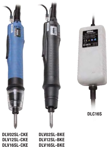
DLV02SL-CKE DLV12SL-CKE DLV16SL-CKE DLV02SL-BKE DLV12SL-BKE DLV16SL-BKE DLC16S